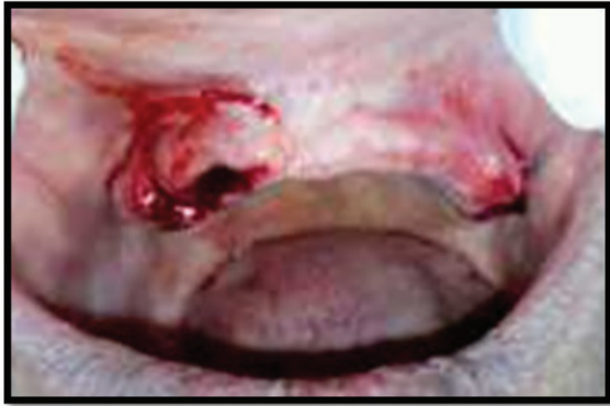
Fig 6: Extraction of maxillary anterior teeth