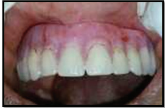
Fig 7: Denture insertion