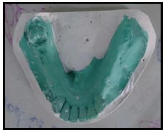
Fig 4 and 5 : Primary maxillary and mandibular cast