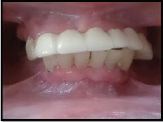
Fig 1: Intra Oral Examination