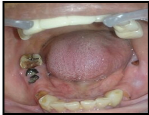
Fig 2: occlusal view