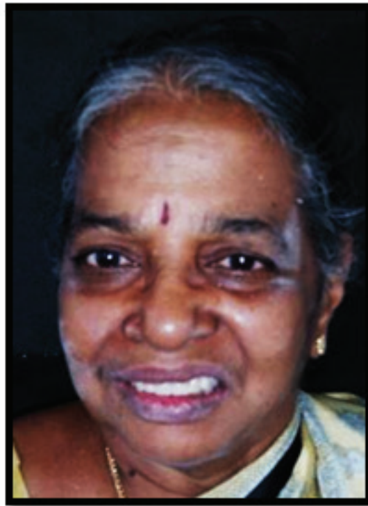
Fig 8: Post-operative profile view

Ethical Clearance – Not required since it is a case report