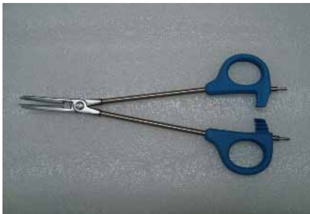
Fig. 5. Bipolar Clamp

A bipolar clamp (Fig.5) can also be used instead of a forceps which can seal the vessels up to diameter of 7mm. Currently BEIM (Fig.6) machines are making a buzz in the market. They are modified form of vessel sealer which automatically senses and deliver the energy required to seal the tissue and stops itself. So tissue charring and lateral heat spread is reduced.