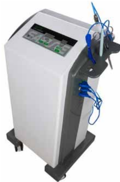
Fig. 6. BEIM Machine

There are various modes in electrosurgical unit like fulguration, desiccation, spray etc. according to need of procedure.