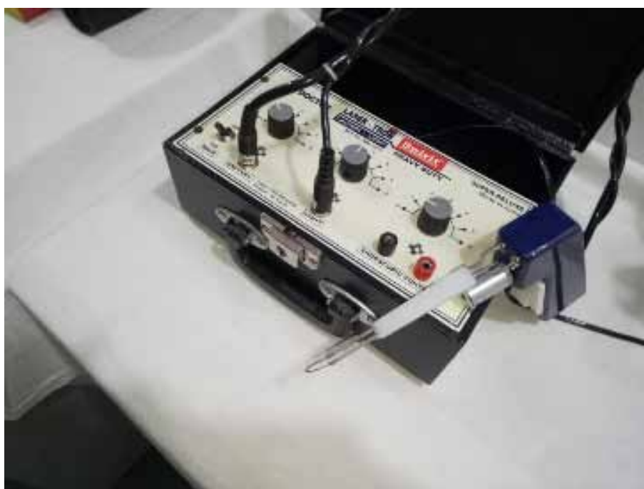
Fig. 2. Electrocautery

Electrocautery: Electrocauterization is a process in which a metal probe heated by electric current and heat conduction is used to cut, coagulate and desiccate (dry) tissues and small bleeders. In this electric current is not passed through tissue but electrode heated by alternating current is directly applied on target tissue area. (Fig. 2) Electrocautery can be used in various minor surgical procedures in dermatology, ophthalmology, plastic surgery, urology etc. 10