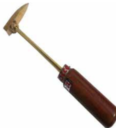
Fig. 1. Agnikarma Shalaka

electrocoagulation machines can be understood after knowing basic mechanism of these machines.