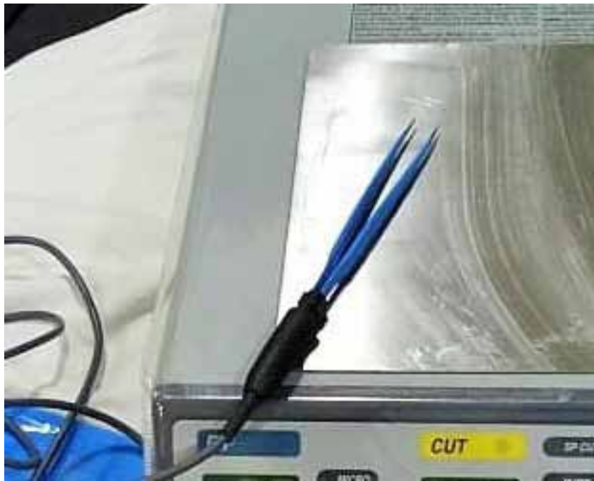
Fig. 4. Bipolar Forceps