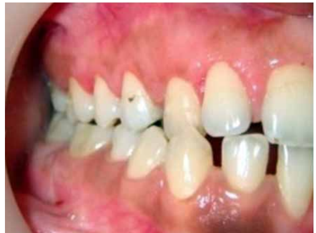
Figure 4: Postoperative view after 9 months

The present case was weekly follow-up visits for the first month. The reason was to have meticulous plaque control and had an optimum healing. After 2 weeks, suture was removed and washed with normal saline in the surgical site in order to clean the area. Later on, recall visits were done monthly during the next 9 month. These recall visits revealed that the patient maintained oral hygiene perfectly.