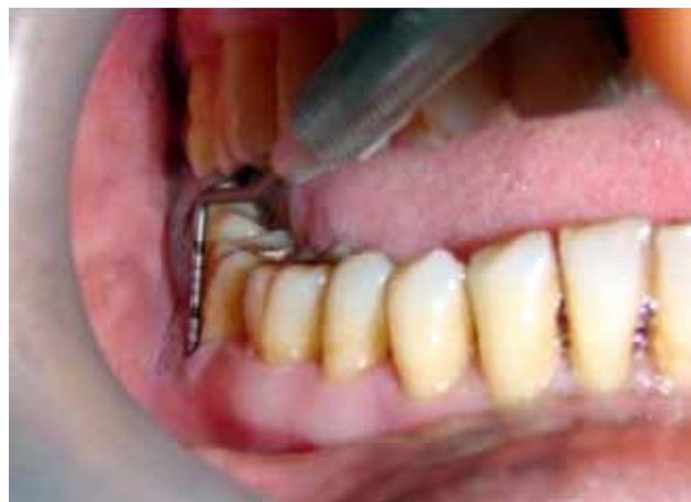
Figure 1: Preoperative view showing 5 mm periodontal pocket in 47

stain and calculus. There was tender on percussion in 47. There was periapical radiolucency in intraoral periapical radiograph in relation to 47 as shown in figure 4A. The vitality test was found negative in 47. 6 The treatment plan was made as first oral prophylaxis (remove the plaque and calculus) to reduce inflammation, then endodontic treatment followed by periodontal treatment. The patient was free from any systemic diseases, and without tobacco chewing habits.