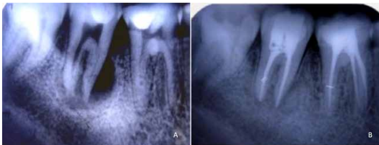
Figure 5: A (Preoperative), B (Postoperative) intraoral radiograph in relation to 47

After 9 months, IOPA in relation to 47 revealed there was completely filled up with bone and formation of lamina dura in the defect as shown in figure 5 and she was very satisfied with the result.