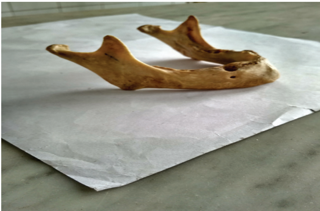
TYPE:I TRIANGULAR SHAPE

Figure I showing triangular shaped coronoid process which is more observed in current study. (6,7,13)