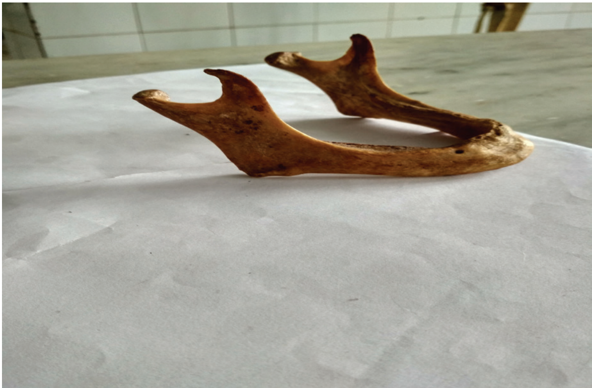
Figure III showing Hooked shaped coronoid process which is very few observed in current study.