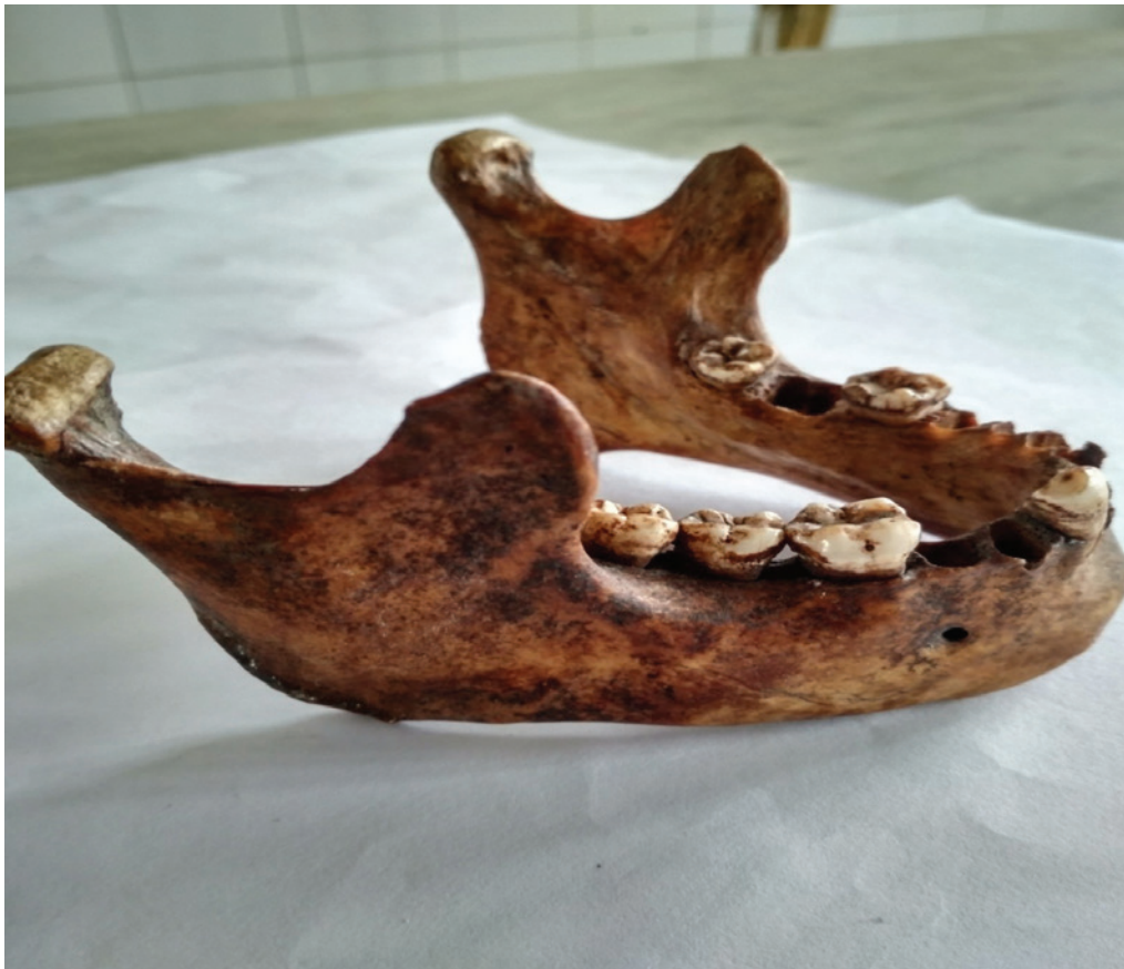
TYPE:II ROUNDED SHAPE . Figure II showing Rounded shaped coronoid process which is less observed in current study.