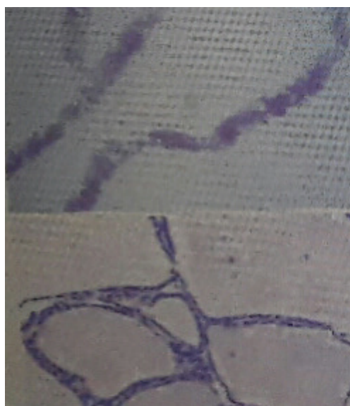
Figure 1: Core needle biopsy shows macrofollicular proliferation