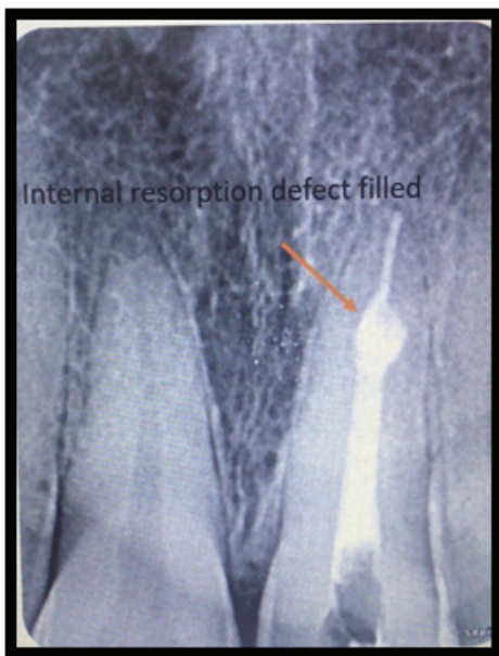
Fig 5: Backfilling of the canal

Step 6: The tip of the elements extruder unit was brought in contact with the coronal extent of the GP in the resorption defect and was then used to backfill the canal in increments with alternate packing using the pre-selected Buchanan hand pluggers. (Fig