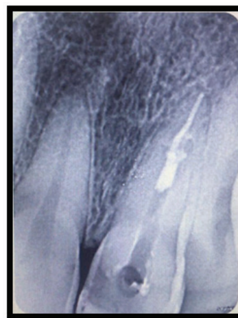
Fig 3: Excess GP removed

Step 3: The Fine heated plugger was then driven into the canal to remove the GP, 2 mm short of the resorptive defect. (Fig 3)