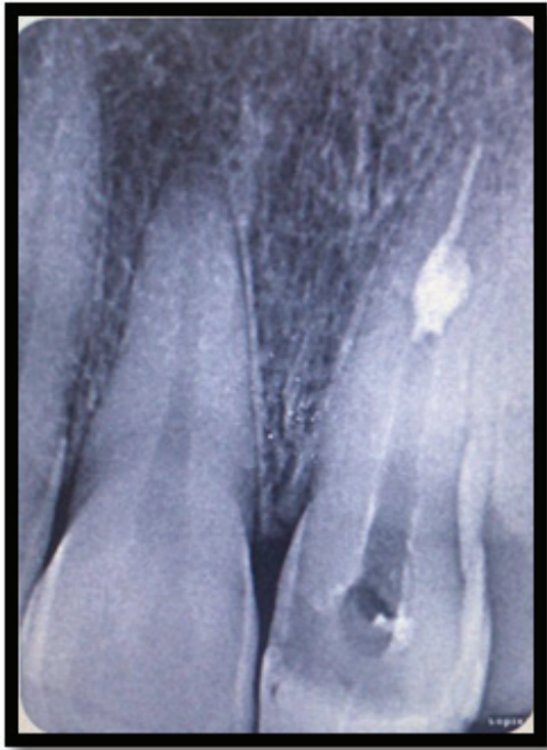
Fig 4: GP plugged into the resorptive defect

Step 5: The rest of the canal was now coated with Zinc oxide based sealer (Tubli Seal™, Kerr Endodontics)