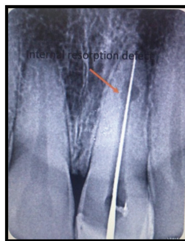
Fig 2: Master cone fit

Step1: The master cone selected was coated with BioRoot RCS sealer and was fitted up to the full length of the root which was confirmed with a radiograph. (Fig 2)