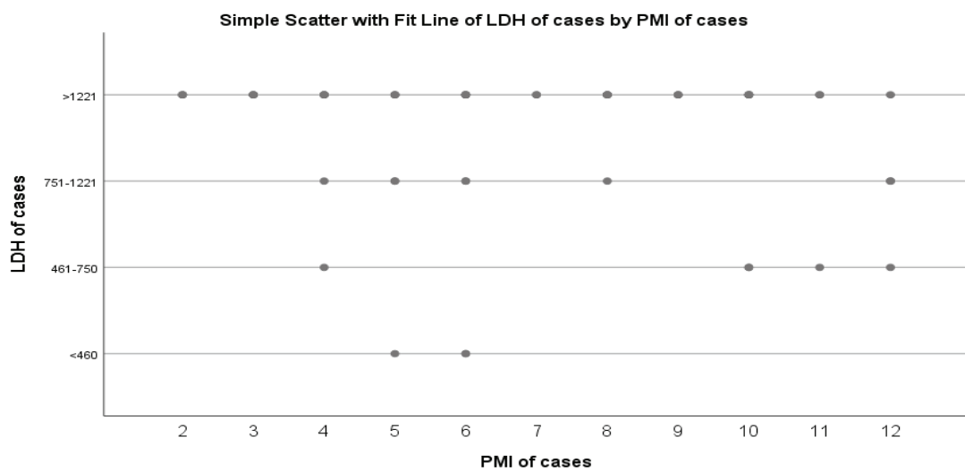
Figure (3): Correlation between LDH and PMI.