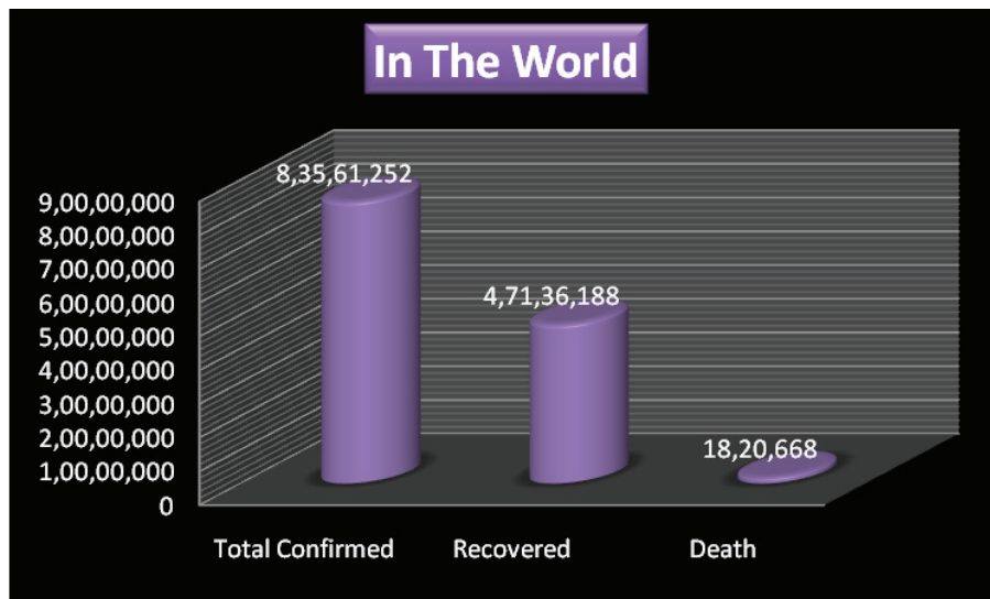
Figure (1): Spreading Cases (Total Confirmed, Global Recovered, Global Death) in the World.

2,100,650 Turkey, 1,508,419 Colombia, 1,463,111 Italy, 1,426,676 Argentina, 1,355,384 Germany). And global death represent in (345,844 US, 194,949 Brazil, 148,994 India, 125,807 Mexico, 74,159 Italy, 73,622 United Kingdom, 64,760 France, 56,798 Russia). From this result the Arab nation including 3,139,205 total confirmed cases, 2,783,448 recovered cases and 55,326 death cases from 21 countries infected with 2019-nCoV show in Figure (2) between this result the Iraqi infected patients represent 595,291 total confirmed cases, 537,841 recovered cases and 12,813 death cases show in Figure (3).