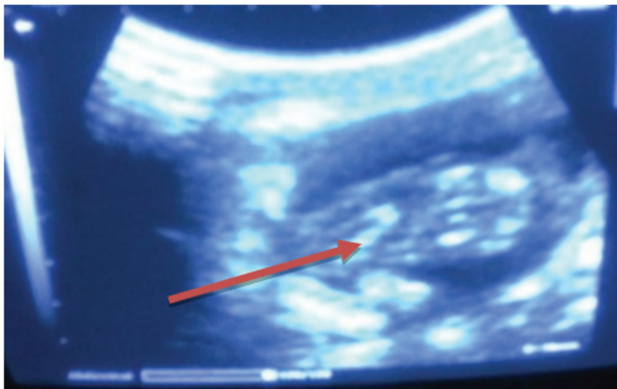
Fig (2) fetus at 74 days of gestation in Iraqi Awassi ewe / Trans-abdominal probe ( 4MHz)

Ethical Clearance: The Research Ethical Committee at scientific research by ethical approval of both environmental and health and higher education and scientific research ministries in Iraq