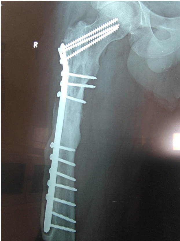
Figure 3: Show X-ray of lower limb, male, 22y, and show infected proximal femoral plate after car accident for more than two years.