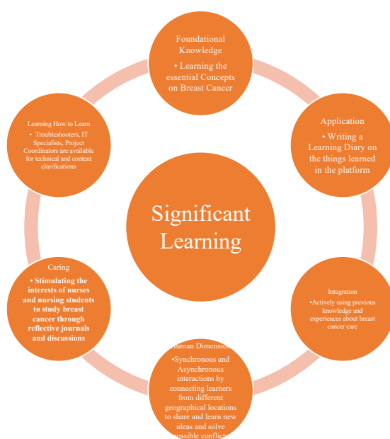
Fig. 1: Fink's Taxonomy of Significant Learning on the application of Breast Cancer Education using E-Learning Platform

The motivation to study is an important factor in the success of learning online. Students must care about studying the subject 11 . Learning online requires good time management, intrinsic motivation, and determination 9 . Learners must show interest in studying breast cancer not online, specific to their field, but also in understanding the perspectives of other healthcare professionals.