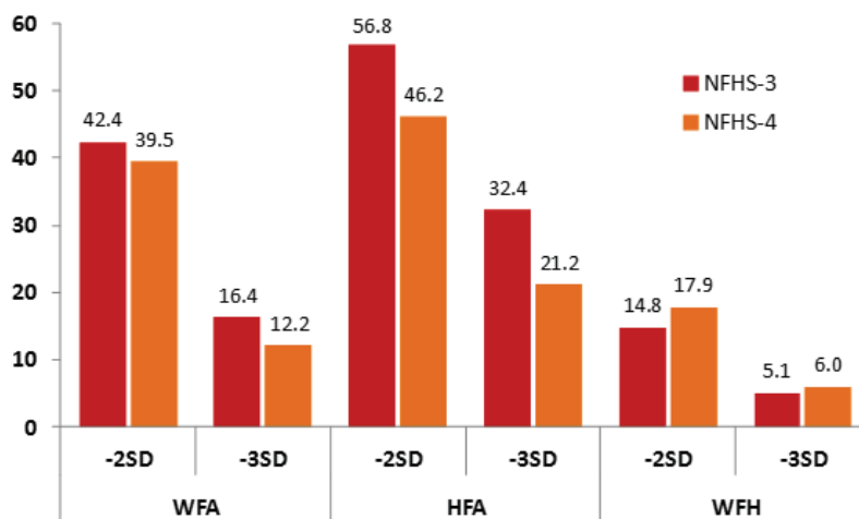
Figure 1: Level of malnutrition among children (0-59 months) in NFHS-3 and NFHS-4

Stunting decreased from 57% to 46% in the 10 years between NFHS-3 and NFHS-4, and the percentage of underweight children decreased marginally from 42% to 40%. However, in the same period, wasting increased from 15% to 18%. Thus, despite recording gains in stunting and underweight during the last decade, child malnutrition is still a major problem in Uttar Pradesh state (Figure 1). There were only small differences in the level of undernutrition by the age and gender of the child. The proportion of underweight and stunted was lowest for youngest children (<12 months), but they were having the highest wasting (weight for height). Male children (19%) recorded more wasting compared to female children (16.6%). Children born in Schedule Caste (SC) and Scheduled Tribe (ST) households were relatively more malnourished compared to children belonging to other castes households (Table 1). No differences in child nutrition were observed by the religion of the head of household. But children from rural areas were relatively more underweighted (41%) compared to urban (33.7%) areas, however, there was no difference in severely underweighted children by place of residence. In the case of stunting, more rural children were stunted (48.5% vs 37.9%) and severely stunted (22.7% vs 15.4%) compared to their urban counterparts, however, and no such difference was observed in the case of wasting.