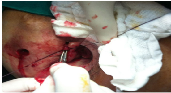
Figure 1: Repairing the fistula tract: the right one next to the edge of the internal sphincter and the left is by the external sphincter

Statistical analysis: Fistulae of different types were classified with percentage. The duration of surgery and healing was compared with z test. The statistical analysis was carried out in SPSS software. The ratio of male and female was 3:1.