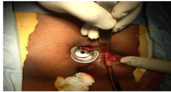
Figure 3 (b): Partial core-out fistulectomy performed from the external opening to the outer border of the external sphincter