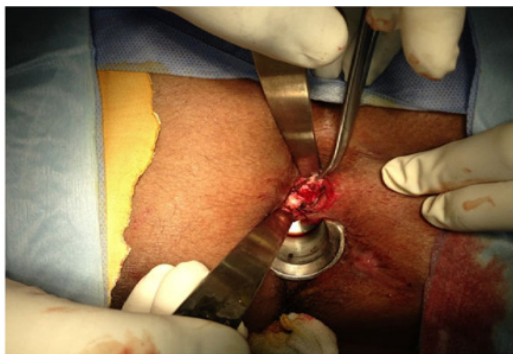
Figure 3 (a): The tract was transfixed close to the internal sphincter with 2/0 Vicryl and divided distal to the point of ligation