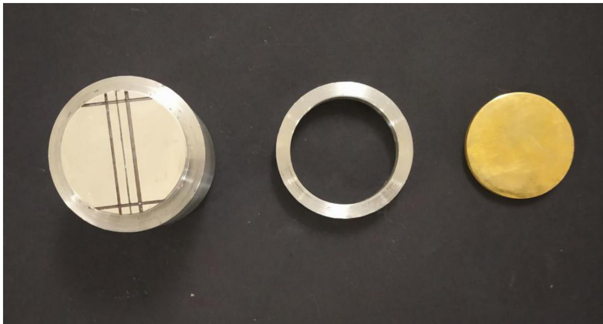
Figure – 1: Metallic master die with riser

*-Friedman’s Repeated Measures ANOVA; **-Kruskal Wallis Test; # -Wilcoxon Signed Rank Test (Post Hoc); $-Statistically Significant.