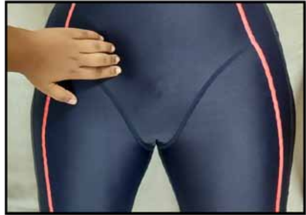
Figure 1: Palpation of iliopsoas muscle