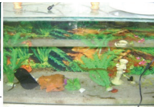
(Figure 1: Material required in Leech therapy)