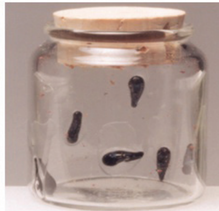
(Figure 2: Purva Karma in Leech therapy)

In purvakarma mainly snehana (oleation) and swedana (sudation) of the patient is done and cleaning of part of the body to which leech is going to be. For leeches to suck maximum amount of blood very quickly without any problem, they must be stimulated and energized. This is done by applying the paste of mustard and turmeric powder on the body of leech or drop leeches in the water containing turmeric powder and it is found that an inactive leech becomes active.