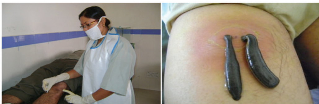
(Figure 3: Pradhana Karma in Leech therapy)