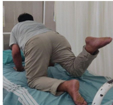
Fig 1: Quadruped Hip Abduction