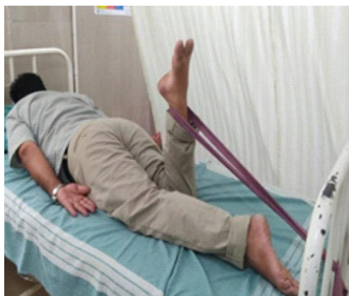
Fig 5: Prone Hamstring Curls