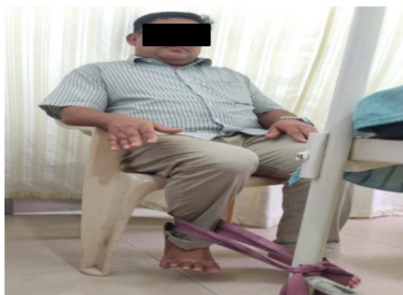
Fig 4: Seated Thera-band Hamstring Curls