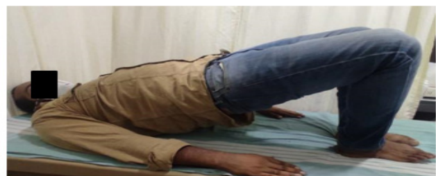
Fig 3: Bilateral Pelvic Bridge