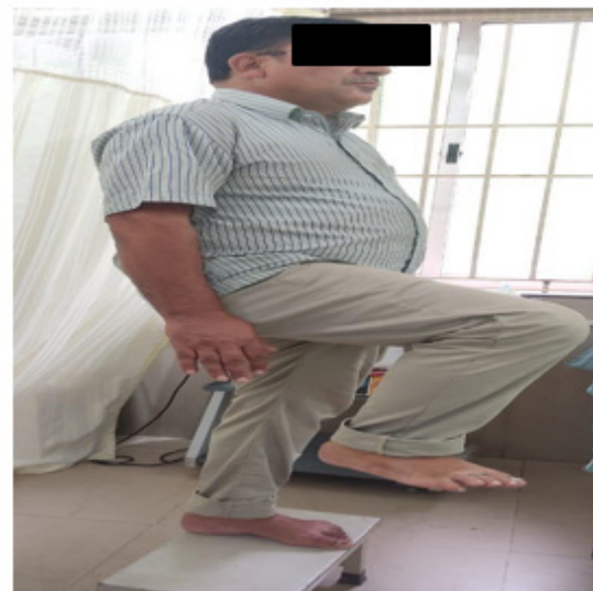
Fig 2: Forward Step Up