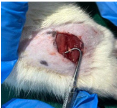
Fig-1: Exposure of sciatic nerve

During the study, rat surgery was conducted under anesthesia with ketamine hydrochloride (70mg/kg) and xylazine hydrochloride (10mg/kg). The rats were placed in a ventral recumbency position, and a 3cm incision was made on the skin to expose the right sciatic nerve, which was then crushed for 30 seconds using hemostatic tweezers with a force of 54 N, resulting in a 3mm long crush injury 9 . The surgical site was closed with silicon 3/0 thread, and the rats were placed in individual cages. To manage post-operative pain, a single subcutaneous dose of meloxicam (1mg/kg) was administered (Figure 1).